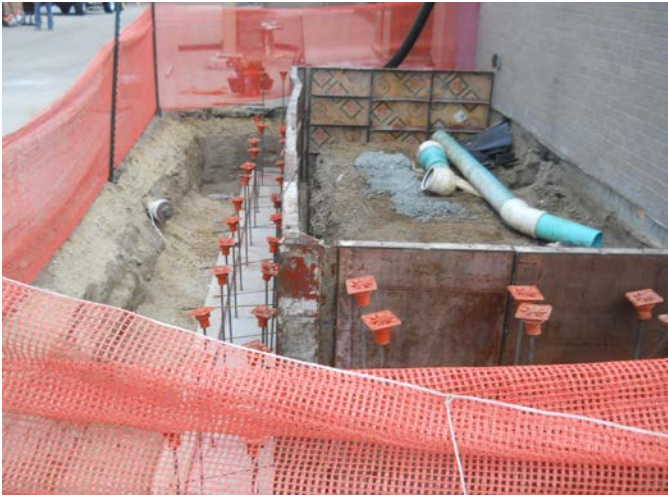
Concrete Forms Started