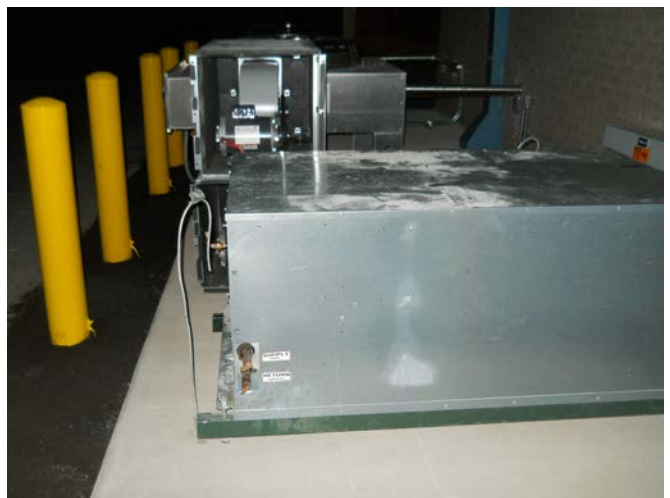
Outside Condensing Units