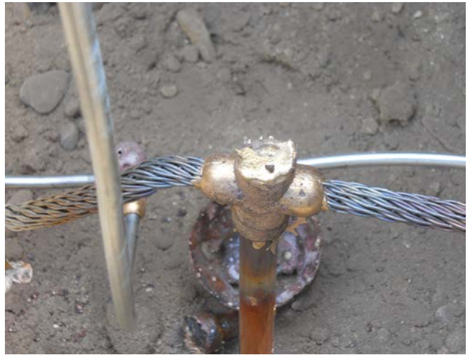
Cad Weld at Lightning Rod