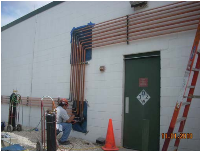
Welding pipe for Liebert Unit #2