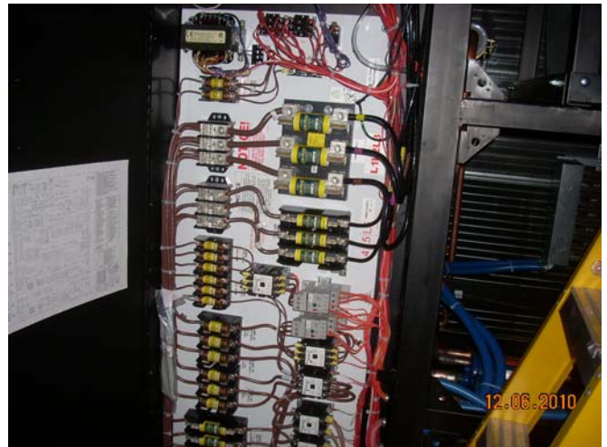
Wiring for Liebert Unit #2