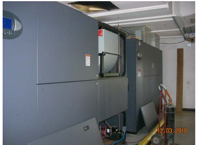
(2) 60 Ton Liebert Units set