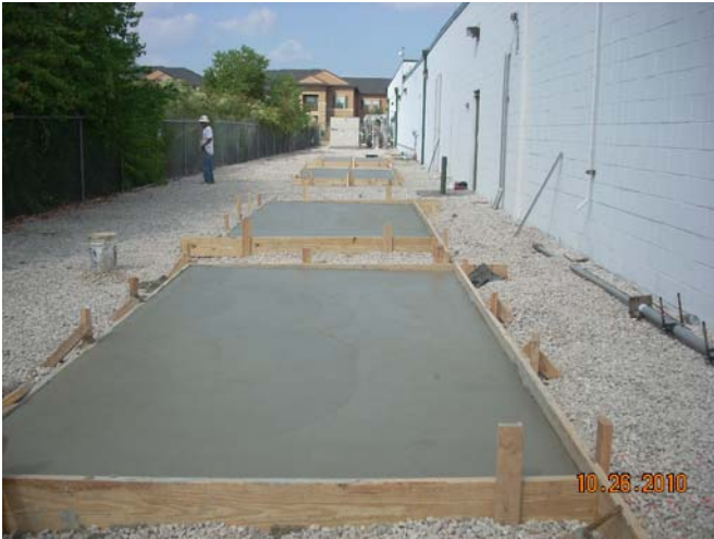
Concrete pads for new condensing units