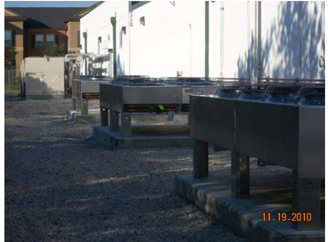
New Liebert Condensing Units